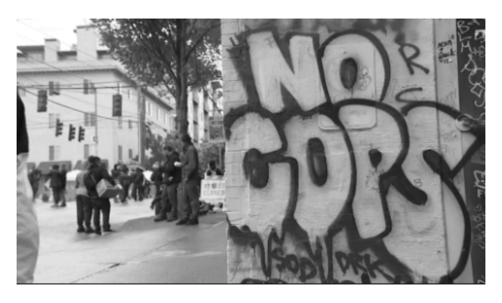
Chapter 3. Anarchist Theory and Practice

Could a liberated zone have been won, so that dual power could have been established? That possibility existed and still does exist if the people are properly armed and educated Mass resistance with heavy military weaponry may have won serious concessions, one of which is to pull back the cops. We don't know that, this is purely speculation. We do know that this is not the last rebellion in L.A. and other cities. They may come much quicker now that the genie of urban revolution of the bag again. We can only hope and prepare. Onward to the black revolution!