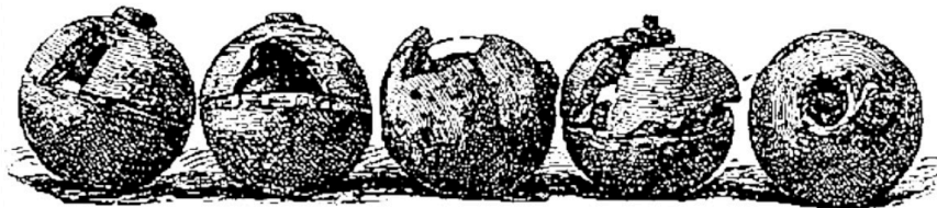
3. Bombs used in evidence, after analysis by chemists.

The true contrary of the proletariat is not the bourgeoisie. It is the bourgeois world, imperialist society, of which the proletariat, let this be noted, is a notorious element, as the principal productive force and as the antagonistic political pole... To say proletariat and bourgeoisie is to remain within the bounds of the Hegelian artifice: something and something else. Why? Because the project of the proletariat, its internal being, is not to contradict the bourgeoisie, or to cut its feet from under it. This project is communism, and nothing else. That is, the abolition of any place in which something like a proletariat can be installed. The political project of the proletariat is the disappearance of the space of the placement of classes. It is the loss, for the historical something, of every index of class. —“Theory of Worlds,” pg. 7