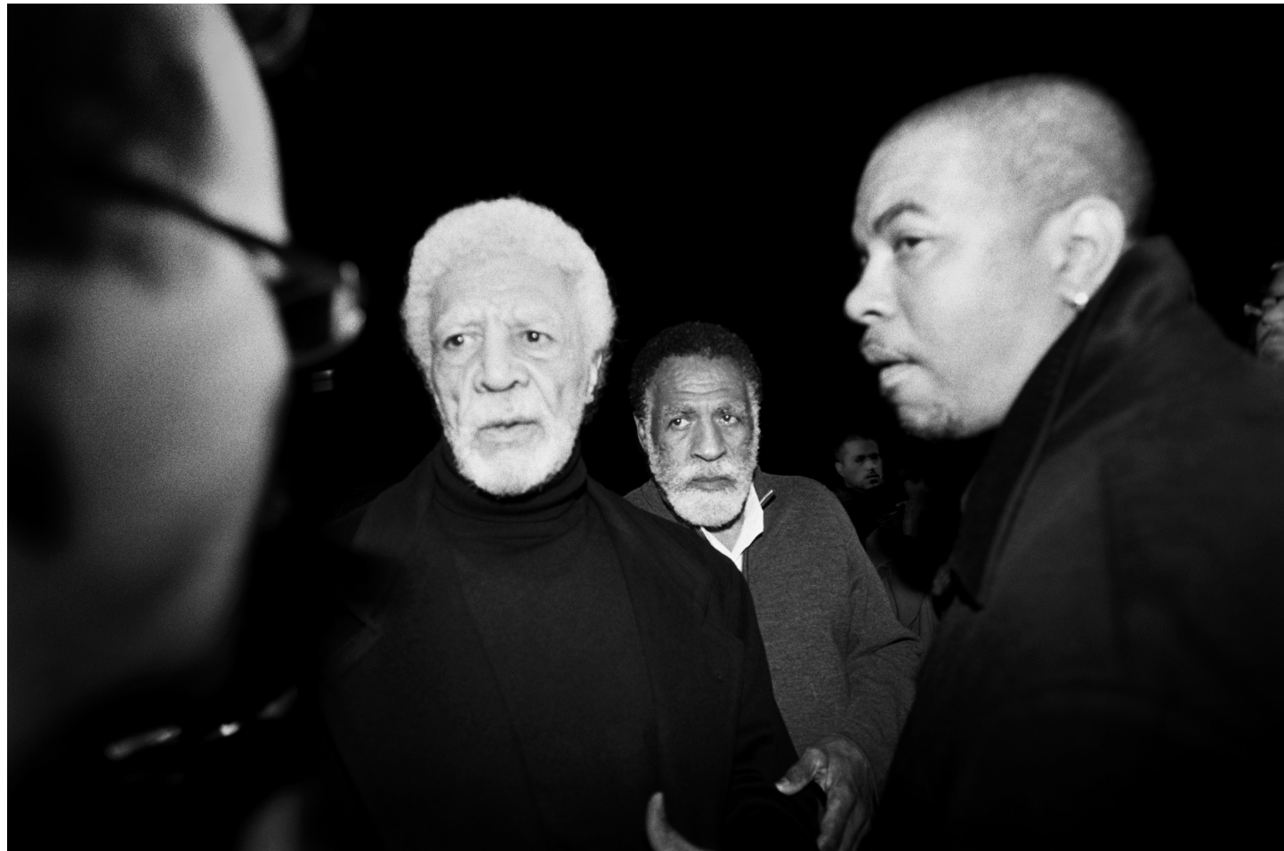
Oakland rebellions, January 7, 2009

“routine stops” alongside members of Oakland’s nascent Copwatch organization. We spoke with two young, black men on the 98 block of Macarthur Boulevard who had been cuffed and detained for “matching the description” of subjects suspected to be in possession of a firearm. That is to say, they were young and black, and wearing black hoodies and jeans, just like everyone else around that night. Five minutes after Copwatchers arrived to document the stop, they were released.