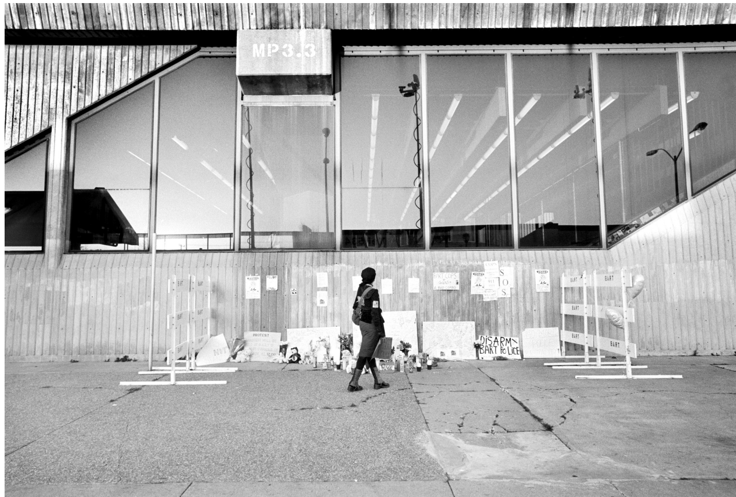
Fruitvale Bart, Oakland rebellions, January 7, 2009