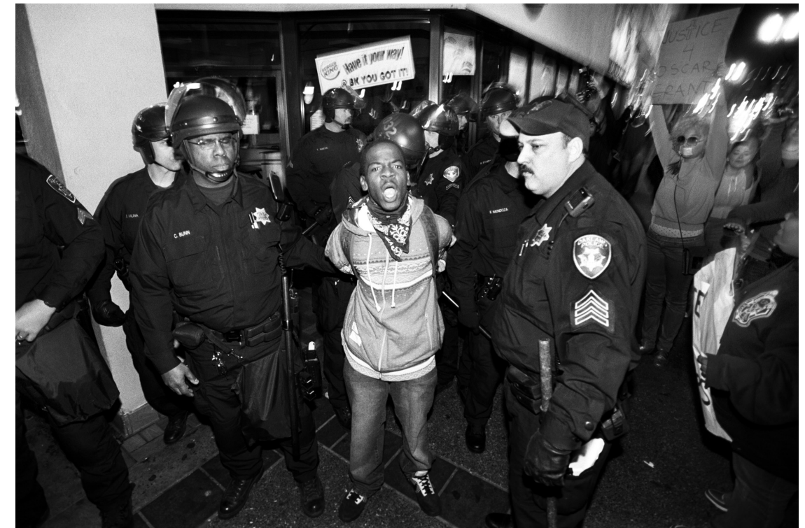
Oakland rebellions, January 14, 2009

In the back of the wagon, we were a sorry-looking lot, my friend bleeding profusely from the forehead, and one of the McDonald’s arrestees