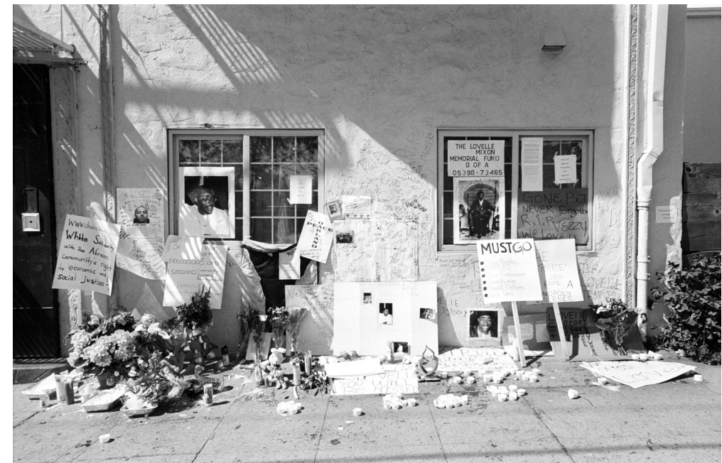
Memorial for Lovelle Mixon, March, 2009

Such are the status of “routine stops,” and in a country where racial profiling is all but accepted practice among police, we should be wary of any claim to “routine-ness.” The only thing “routine” about such stops is the harassment that the black and brown community suffer at the hands of the police every day.