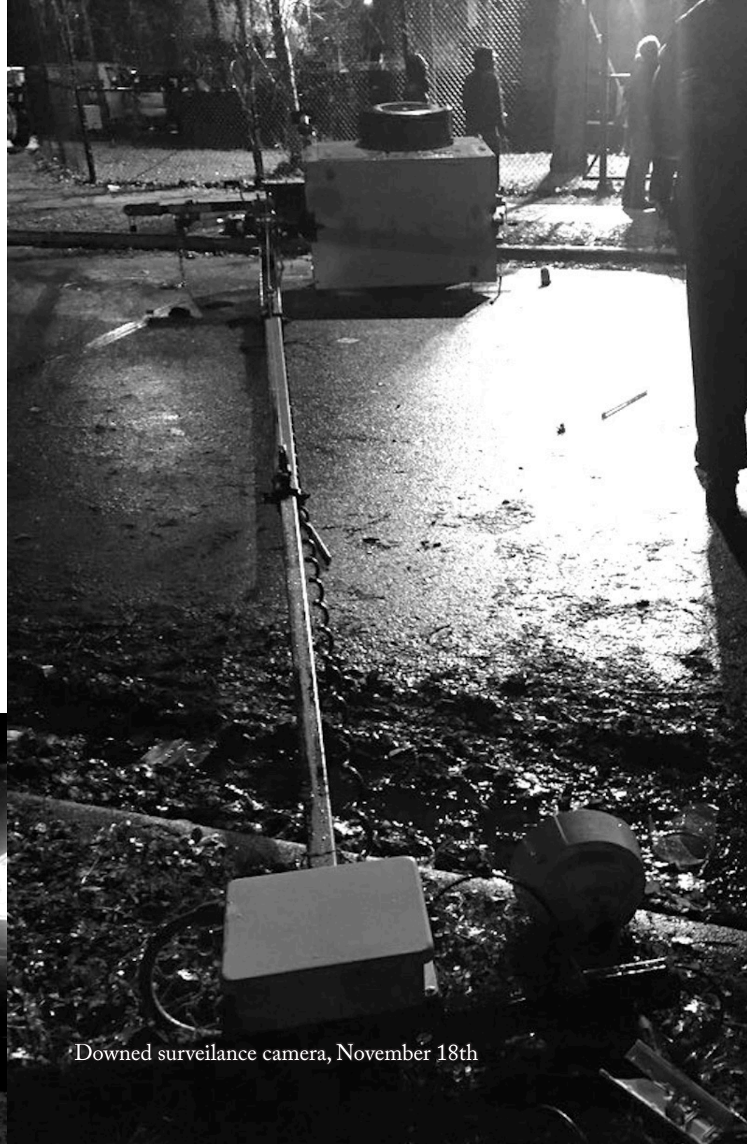
Downed surveillance camera, November 18th