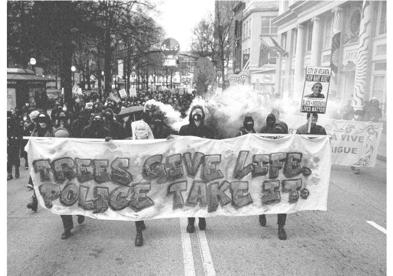
TWO YEARS OF FOREST DEFENSE IN ATLANTA

At the time of publishing, more information about the movement can be found at defendtheatlantaforest.com or on social media under the names “Defend the Atlanta Forest” and “Stop Cop City.”