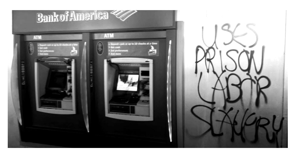
SUPPORT: WHAT WORKED

Excerpt from an interview on The Thread: A Podcast against Mass Incarceration, episode #1