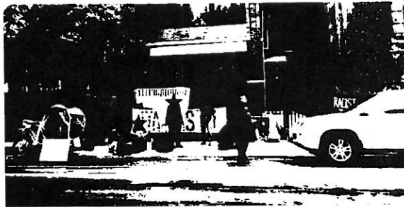
The Fight to Close Child Detention Centers in Chicago - It'... Heartland Alliance operates at least nine detention centers for migrant children in the Chicagoland area. The children in these