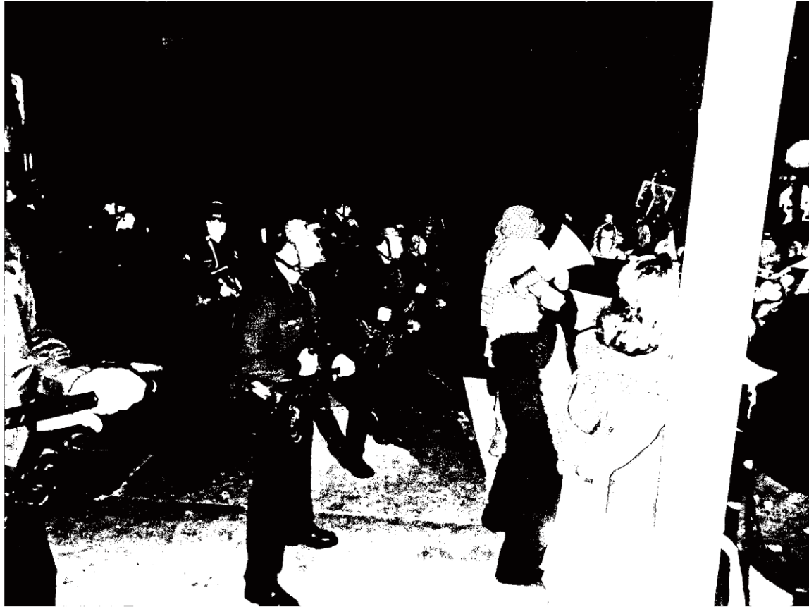
[Protest marshals and 'organizers' stand in front of a line of riot police, facing the protestors with their backs turned to the heavily armed threat.]

Protest marshals are an extension of riot police. In fact, protest marshals will often literally stand right in front of armed riot police, with their backs to them facing towards the protestors and holding the goal of keeping them in line. The goal is maintaining order. In this sense, protest marshals are the police state's keffiyah-wearing ("safe, welcoming physical presence" as the Department of Justice puts it) front line against the people , as seen at this December 8 protest outside a fundraiser for President Biden: